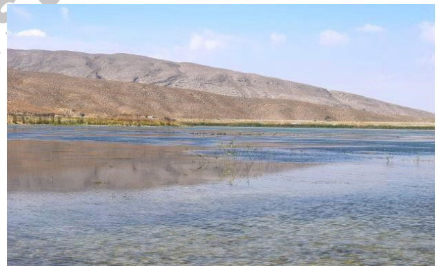
Fig. 1. A wide range view of Spin Karez Lake, Quetta, Balochistan, Pakistan.

The research project focused on Spin Karez Lake, situated 6-8 miles (10-13 km) from Quetta city, with precise GPS coordinates at 30°13'20" N and 67°9'4" E; approximately 1994 meters above sea level. This small lake, surrounded by mountains, provides an aesthetically appealing and ecologically suitable habitat for various water-dwelling bird species (Fig. 1). The study period spanned from October 2019 to March 2020, during which bi-weekly visits to the study site were conducted and observations recorded between 10:00 and 18:00 h, bihourly. Observations of diverse bird species were meticulously recorded by utilizing a DSLR camera (Nikon D5300) with a lens specification ranging from 18 mm to 55 mm (zoom). Individual observations were documented through photographs, with each observation replicated three times, followed by the calculation of an average. Evaluation of the recorded birds included species identification, diversity indices, and subsequent calculation of each species spatial range (Extent of Occurrence, EOO).