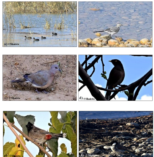
Fig. 2. Birds visiting Spin Karez Lake, (a) Fulica atra (Eurasian coot), (b) Motacilla alba (white wagtail), (c) Spilopelia senegalensis (laughing dove), (d) Acridotheres tristis (common myna), (e) Pycnonotus cafer (red-vented bulbul), and (f) Pycnonotus leucotis (white-eared bulbul).

The spatial distribution of encountered species at Spin Karez Lake was examined using presence-based data, and a minimum convex polygon was delineated for each bird species individually. The results of the extent of occurrence indicated (Fig. 3) the most common and widely distributed bird species across the Asian continent and nearby regions (Table I).